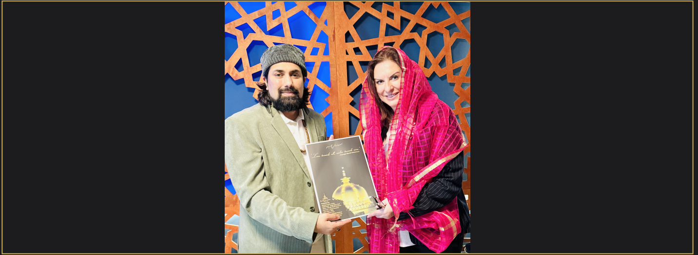
Presenting 'Love Towards All, Malice Towards None' — the Chishty Foundation's spiritual gift to Moscow

Moscow · Spreading the Light of Khwaja Gharib Nawaz