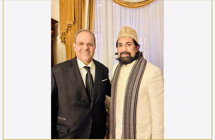
Strategic meetings with Russian partners and business leaders — Moscow

“Wherever you are, whatever you do, be in love.” — Rumi