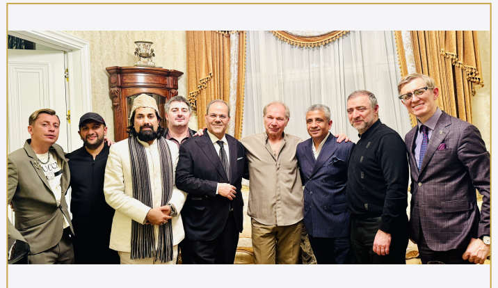
Sharing knowledge · Reception with Moscow's Indian and Russian community leaders