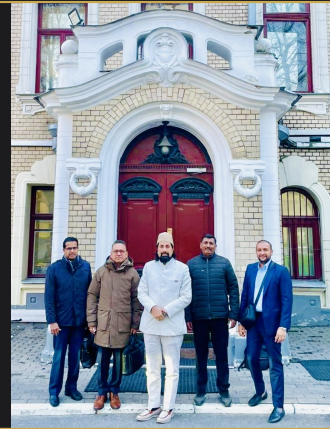
With the delegation across historic Moscow

“The seeker of God is the finder of God.” — Khwaja Moinuddin Chishty (R.A.)