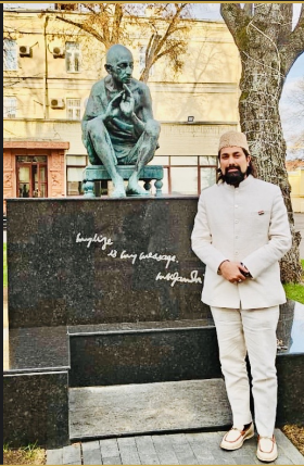
At the Mahatma Gandhi Memorial, Moscow