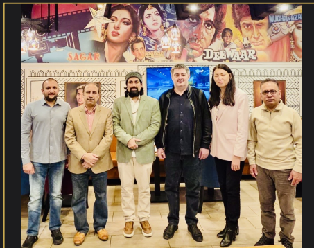
Indian community gathering