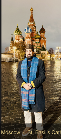
Red Square, Moscow · St. Basil's Cathedral at Night