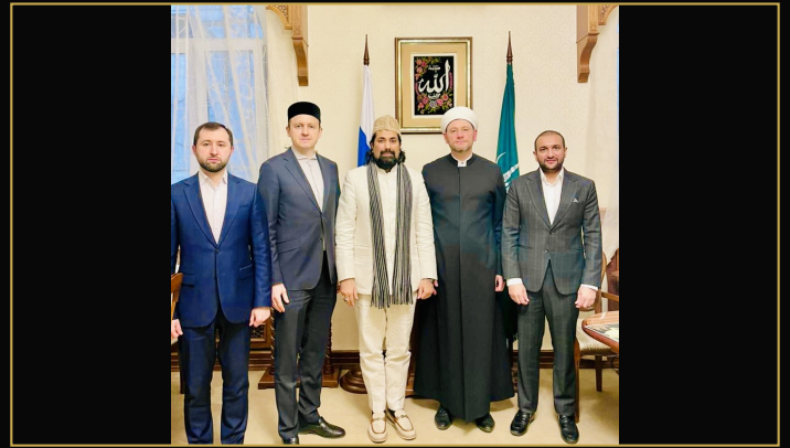
Exchange of sacred gifts and prayers for global peace at the Grand Cathedral Mosque

“Sell your cleverness and buy bewilderment.” — Rumi