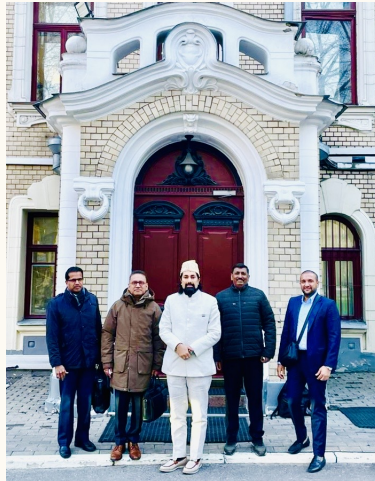
The Chishty Foundation delegation at a historic venue in Moscow.

Prior to and around the Embassy engagement, the delegation was photographed at a historic architectural venue in Moscow, reflecting the grandeur and heritage of Russia's capital city.