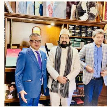
Visit to a luxury Moscow boutique with friends — the warmth and informality of personal diplomacy.