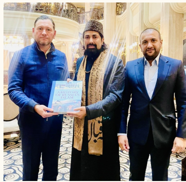
Exchanging A History of Russia's Islam with a Russian contact — a symbolic exchange of civilisational knowledge.