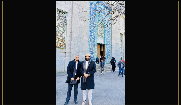
Visiting and praying at the Cathedral Mosque of Saint Petersburg

“There is a candle in your heart, ready to be kindled.” — Rumi