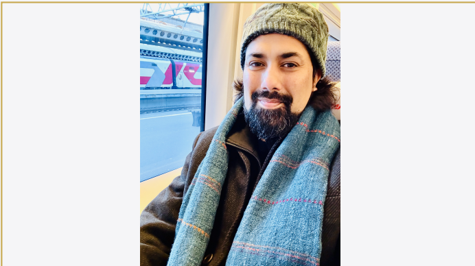
En route — aboard the Russian rail

The Chishty mission carries this spirit — from Ajmer to Saint Petersburg