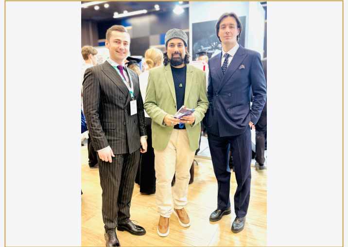
Meetings with Russian academic and institutional leaders at the Saint Petersburg Education Forum