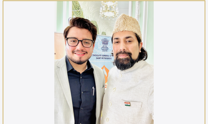
At the Consulate General of India, Saint Petersburg

“The world is a mountain; whatever you say, good or evil, returns to you.” — Rumi