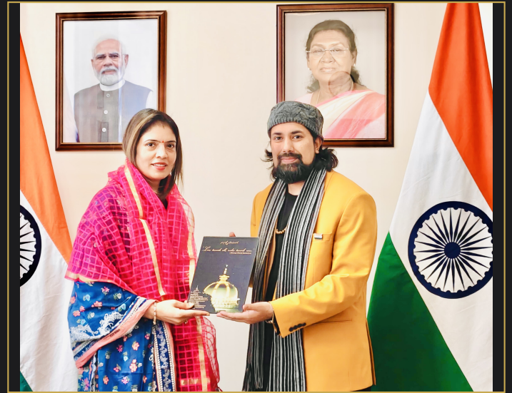
Presenting the Chishty Foundation publication to Indian diplomatic representatives