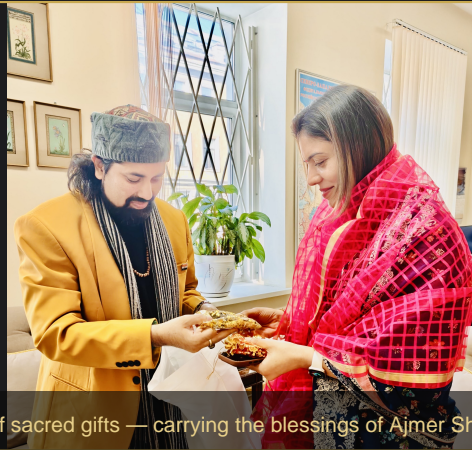
Exchange of sacred gifts — carrying the blessings of Ajmer Sharif to Russia