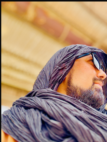
The Sufi Musafir — a seeker gazing towards the horizon