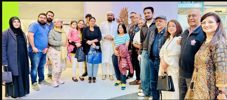
Embraced by the community — after The Poetry of Presence at Noel Ryan Theatre, Mississauga