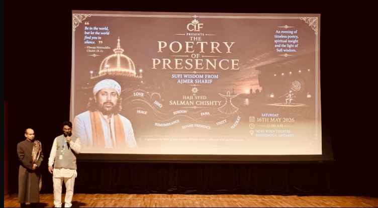
Opening address at The Poetry of Presence — the CLF banner illuminating the stage at Noel Ryan Theatre