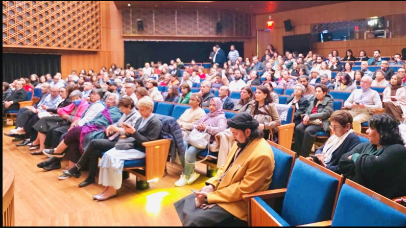
A full house at the Aga Khan Museum, Toronto — Sufi spiritual discourse & screening of Umrao Jaan